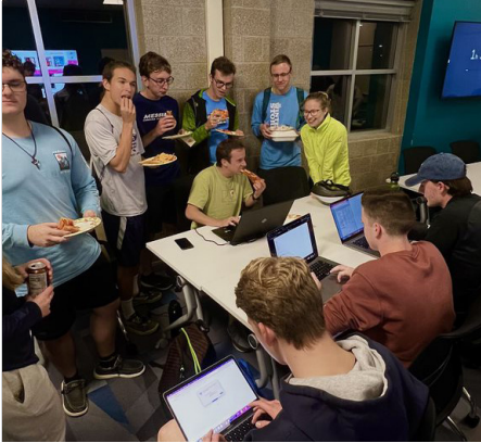
Students enjoy pizza at “Advising” night

and lounge moved from Frey 367 to Frey 351. In addition to serving as home for the Math Lab, where daily tutoring sessions take place, the room doubles as a “hangout” space for our majors.