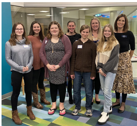
Students attend a talk sponsored by the newly formed local chapter of Women in Cybersecurity