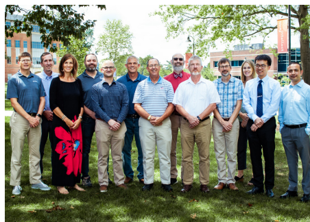
The CMP Department prior to the start of the fall 2023 semester

After the fall 2021 semester, the math lab