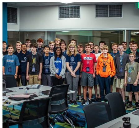
Second annual Cyber Camp welcomes 26 students