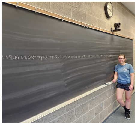
The Math Club celebrates Pi day

The Math Problem Solving Club had a wonderful year of fellowship and exploration of topics in mathematics beyond the classroom. Students participated in Derivative Jeopardy, explored questions in Number Theory, and learned about Fractals. The club also celebrated Pi Day with delicious pies and a Pi digit competition.