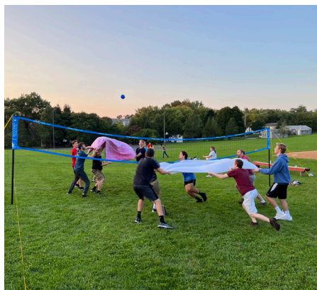
Water Volleyball at the "Welcome Back" Picnic