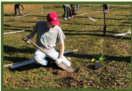
Tree planting at the base of cemetery hill

Biodiversity refers to the variety of plants and animals that reside in a particular area and how they interact. Biodiversity is key to a balanced environment, so it's an area of focus that the Office of Sustainability invests in throughout campus. As the Biodiversity Coordinator, I focus on educating students on the importance of biodiversity, while also helping maintain healthy habitats on campus. One big way we promote biodiversity on campus is through tree planting. Our tree planting event was October 30th and we planted over 150 trees! We planted 100 trees at the base of Cemetery Hill and 50 trees above the Starry Baseball Field. Each tree we plant makes a difference!