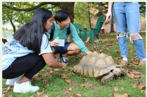
Students petting Gilbert the tortoise