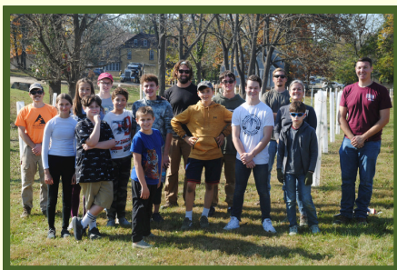
Volunteers at tree planting

Tree plantings on the property are important because they help to provide a healthy habitat for wildlife on campus, as well as helping to offset carbon emissions. It's through projects like this that allow students to get involved in helping keep our campus environmentally balanced and healthy. Our current plan is to include more projects that involve improving biodiversity on campus. I am very excited to take part in helping keep wildlife and plant life living healthily here on campus.