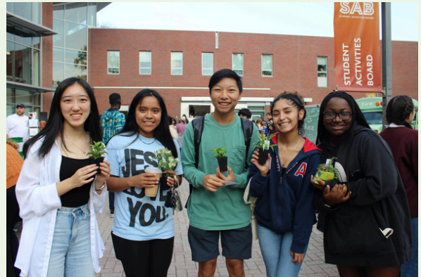
Students received free plants from Ashcombe Farm