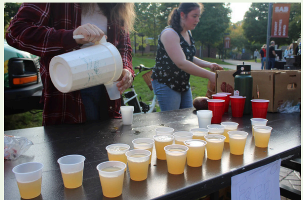
Apple Cider made by Restoration House